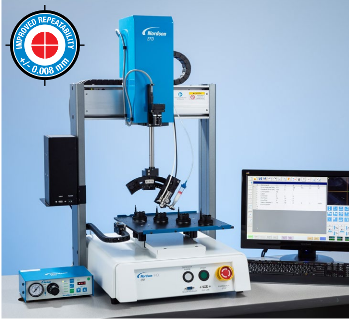
RV Series makes 4-axis dispensing automation more intuitive with proprietary DispenseMotion software.

Easy 4-axis automation for precise fluid application with smart vision