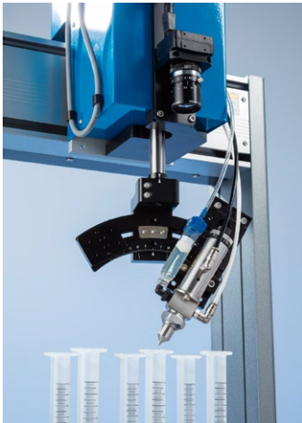
Smart vision CCD camera verifies workpiece presence and orientation.