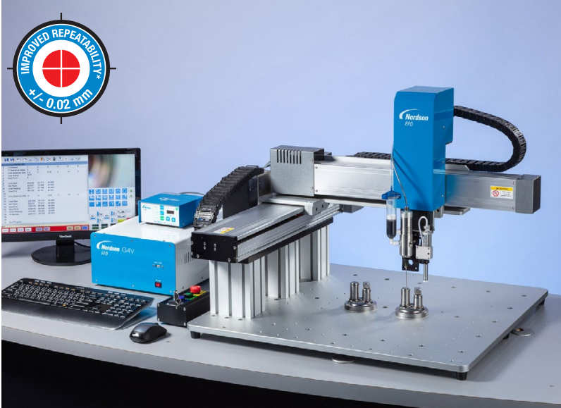
GV Series provides market-leading dimensional positioning accuracy and deposit placement repeatability. *XY calibration delivers best-in-class repeatability